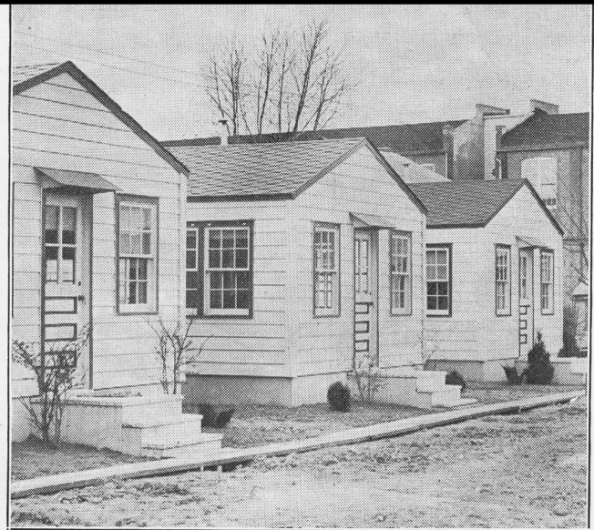
Prospect Court—providing ten comfortable three-room houses for employees.

This, in other words, means backing up the boy at the front, and speeding his day of victory and his return.