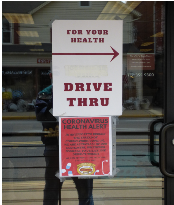
Photos from around town during the height of the Covid-19 pandemic. Garden Spot Village photos on the right. Downtown New Holland at noon is a very eerie scene below.

PO Box 464 New Holland PA 17557 www.NhHistorical.com