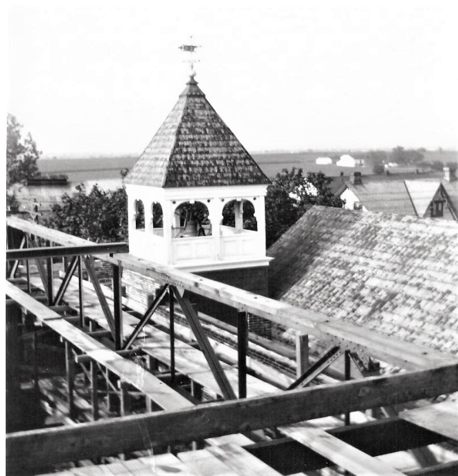
Another photo taken during construction, looking north towards Main Street. This view provides a perspective from the new building related to the old. Part of 273 West Main Street is visible on the right side.